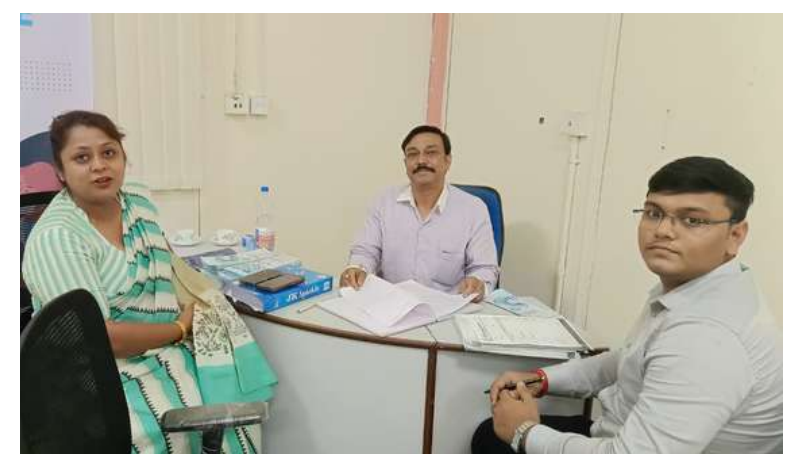
Services included routine checkups and medical advice, focusing on preventive care and early detection of common health issues. The initiative saw enthusiastic participation and received positive feedback from attendees.