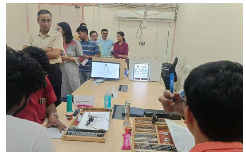
An Eye Camp was held at IISER Kolkata on 6th May 2025 in collaboration with Disha Eye Hospital. The event offered free optometry screenings for students, faculty, and staff, providing basic eye examinations and professional guidance on vision care.