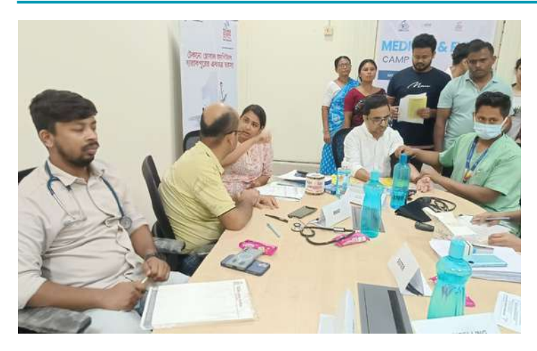
On May 2, 2025, a medical camp was held at IISER Kolkata, organized by Barrackpore Techno Global Hospital. The camp provided general health screenings and basic consultations with physicians and specialists for the institute community.